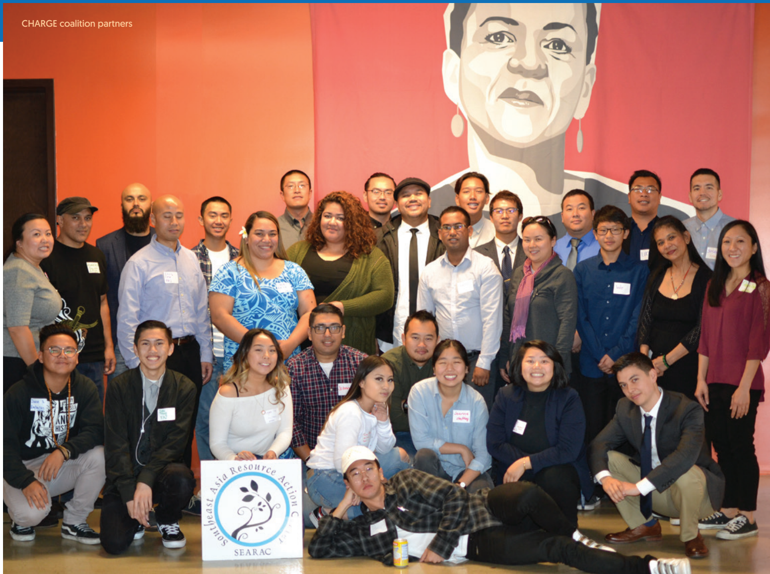
CHARGE coalition partners

SEARAC's Asian American & Pacific Islander Boys & Men of Color Coalition Helping to Achieve Racial & Gender Equity (CHARGE) collected more than 900 survey responses from largely Southeast Asian American and Pacific Islander youth across California to produce the California Asian American & Pacific Islander (AAPI) Youth Report.