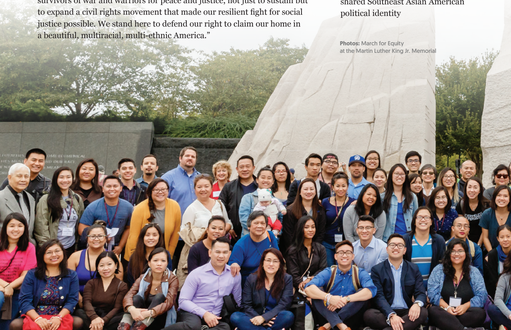
Photos: March for Equity at the Martin Luther King Jr. Memorial