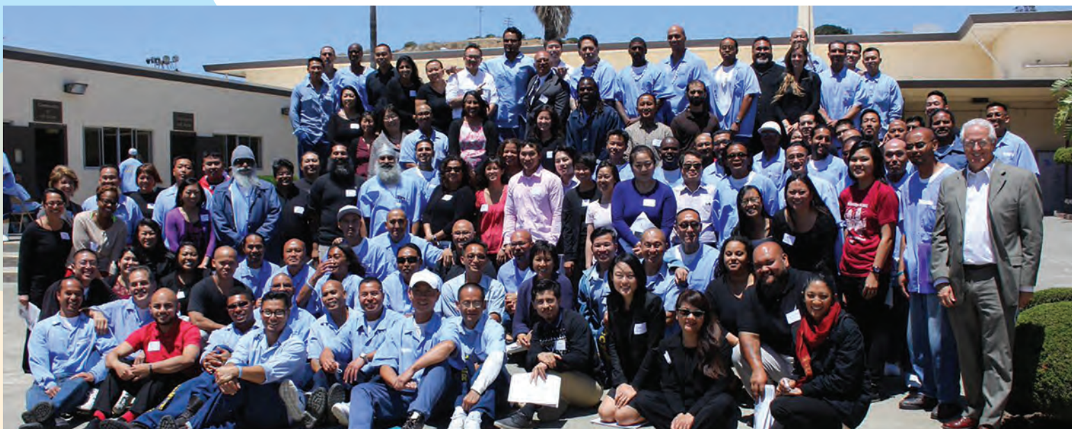
ROOTS volunteers and participants at the AAPIs Behind Bars convening at San Quentin State Prison

Contrary to the Asian “model minority myth” that AAPIs are not touched by violence and incarceration, the Asian American and Pacific Islander (AAPI) prisoner population grew by 250% during the prison “boom” of the 1990s. In some cities, like Oakland, CA, Southeast Asian American youth have had the highest arrest rates among all groups (Cambodians with 63 per 1000, and Laotians with 52 per 1000).